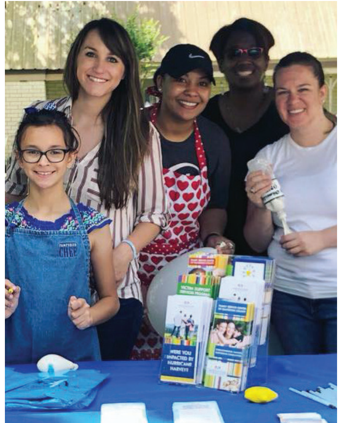
In school settings and at community recovery fairs, Red Cross grantee Family Service Center of Galveston County provides mental health and counseling services for children and families recovering from the trauma of Hurricane Harvey.

Rebuilding isn’t the only need for disaster-impacted communities — counseling and mental health services are also a key aspect of recovering from a devastating event like Harvey, especially for children. Enter the Family Service Center (FSC) of Galveston County, whose mission is to promote mental health and well-being through education, counseling services and prevention.